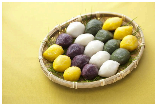
Color palette ideas